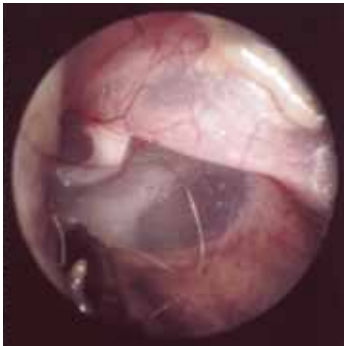
Normal Canine Left Eardrum

IMAGES FROM THE OTOPET-USA VIDEO VETSCOPE SYSTEM