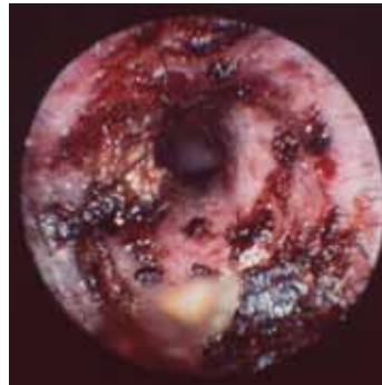
Waxy Ear Canal in a Puppy with Food Allergy and Malassezia