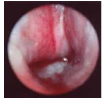
Ulcerated Ear Canal in a Dog with Pseudomonas