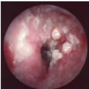
Ceruminous Gland Hyperplasia in a Cocker Spaniel Causes a Roughened Ear Canal Surface