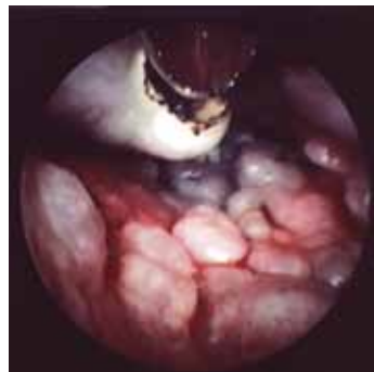
Ceruminous Gland Adenomas in a Cocker Spaniel