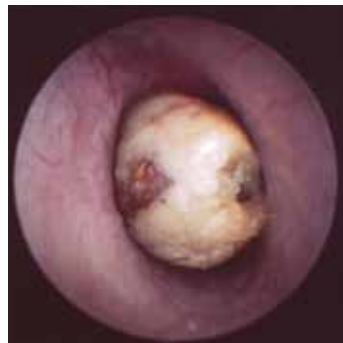
Wax Plug at the Eardrum