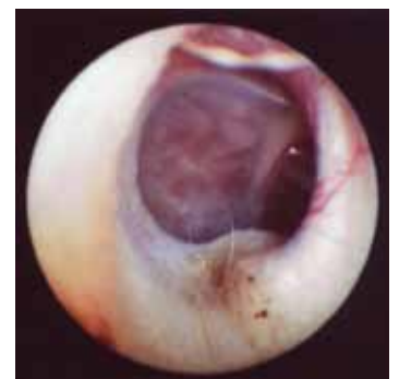
Tumor Mass in a Cat's Middle Ear