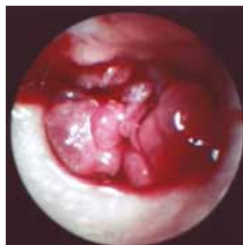
Nasopharyngeal Polyp in a Cat's Ear