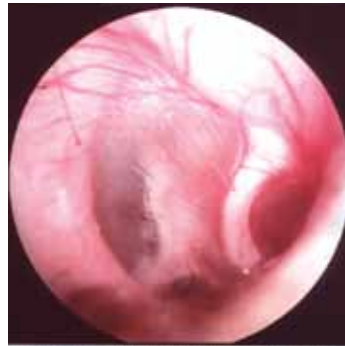
Normal Feline Right Eardrum