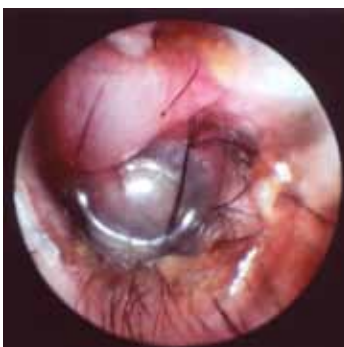
Bulging Eardrum in a Dog with Otitis Media